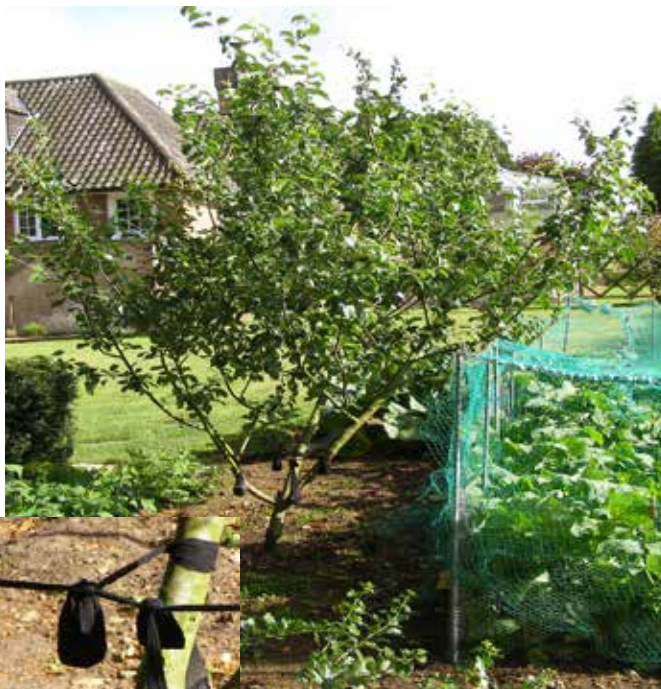
Now touching on eight feet tall, and growing well... The inset shows the stump of the original (and broken) leading shoot, along with anti-squirrel measures — scented soap in sawn off tights!

I'm fortunate in living within walking distance of Lincoln's famous Cross O'Cliff Orchard, where an old tree is