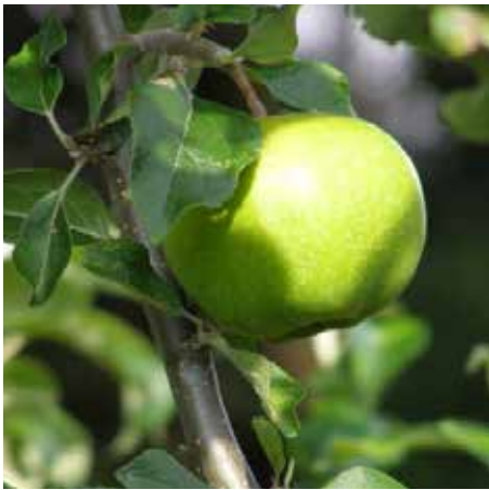
An apple that would tempt any Eve, surely!

listed as a Doctor Harvey , so I'll be over there looking at that tree, its leaves and fruit, and comparing them with mine. I'll take pictures and pass them round.