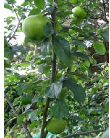
Count 'em! Two fruit top of picture, one more lower down...

branches have been broken; and — possibly most destructive from an owner's point of view — the squirrels steal the blossom and break the younger shoots in their efforts to reach their reward. We have seen little enough blossom anyway, and until this year, no fruit.