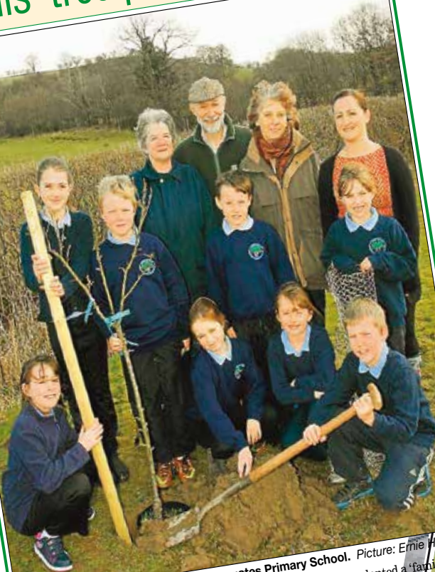
The tree planting takes place at Crossgates Primary School.