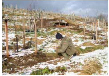
Testing soil pH: also showing site slope, tree guards and spacing

Trees were sourced from nurseries in England, Wales and Scotland. Planting included a few 3-year old trees from the original garden, several Graft 'n' Go specimens, many 1-year old and some 2-year old trees and lately some of my own whip and tongue grafts, including a Bulmer's Norman cider apple from our former orchard in Wigmore, Herefordshire. Most rootstocks are M26, with M25 in the more exposed area and a few varieties on MM106 and MM111. The apples can be classified into four groups: old English, e.g. Charles Ross, Golden Pippin, Ribston Pippin; Scottish, e.g. Bloody Ploughman, Coul Blush, Stirling Castle; Marcher, e.g. Downton Pippin, Stoke