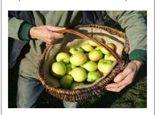
Stirling Castle Harvest: a crop of 20 apples from one tree in 2008

There are several hazards to establishing an orchard, some common to wherever you are but some peculiar to this location. Of immediate concern here is the risk of late spring frosts, the worst recently being -5°C on 17th May 2005. By having over 50 apple varieties, I am hoping the different flowering times will help some of them avoid these isolated but damaging frosts. Notwithstanding our longer summer daylight hours, the maximum temperatures reached are lower than apple trees will experience elsewhere in Britain. From my own daily temperature records there have been only three years in the last ten when the monthly average maximum has been 20°C or above (July in 1999, 2003 and 2006). I expect such low summertime maxima to adversely affect growth rate and productivity. Autumn is early and varieties are much later in reaching maturity than, say, in Kent. We find that Discovery is best eaten 4-6 weeks later, into October, although a friend with that variety inside a polytunnel on the west coast but further north can eat his crop at the normal time. The wind exposure