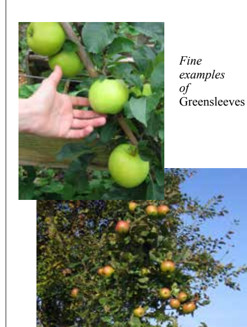
A handsome specimen of Chatley's Kernal