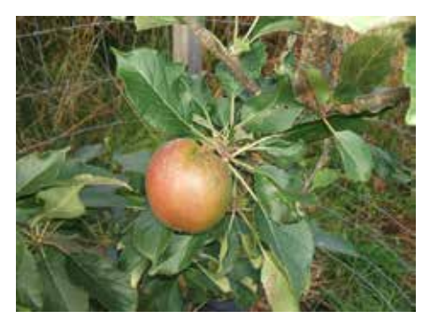
King's Acre Pippin first fruit on this Marcher variety

Initial results have been encouraging in that we are able to eat and enjoy our own apples - in 2008 from 18 different varieties, albeit perhaps only one or two apples from some trees. I cannot compare the taste of a Highland