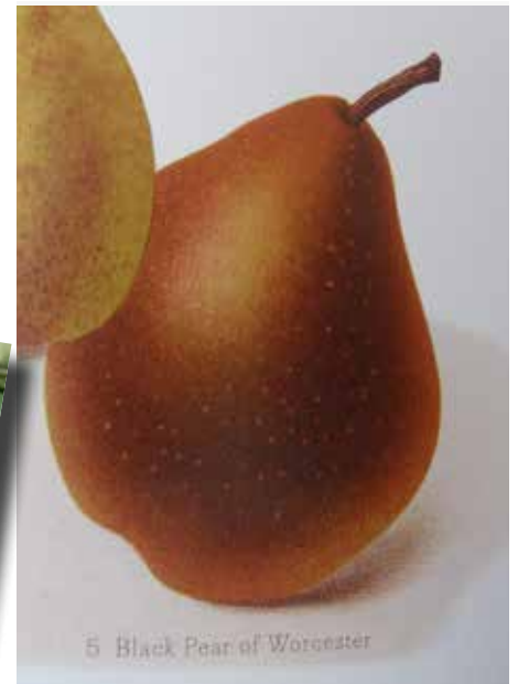
The Herefordshire Pomona illustration of Worcester Black.

Footnote – the use of the term 'Worcester Black' and 'Black Worcester' seem equally split with some references using one and the others the other. For all intensive purposes we mean the same.