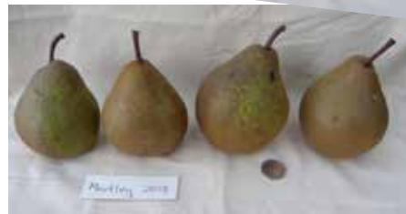
[TOP] Fruit from the Cripplegate tree in October 2015