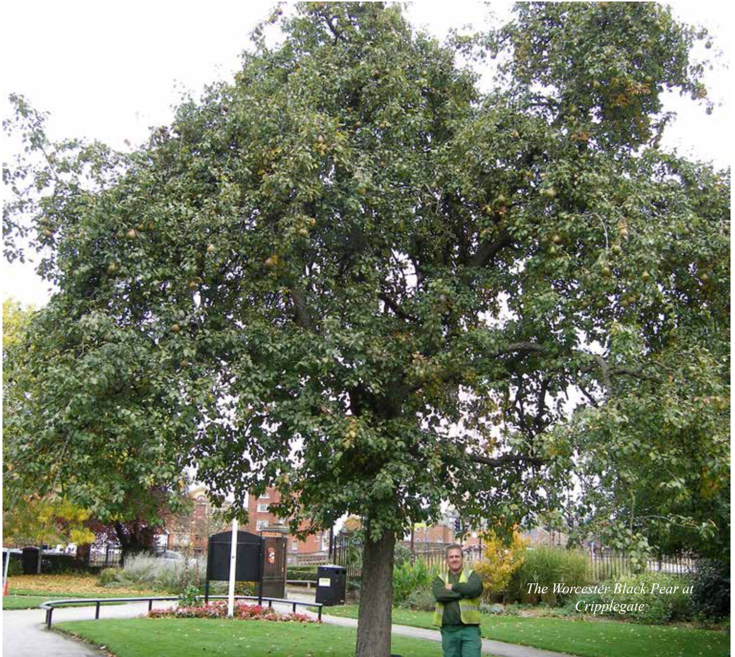
The Worcester Black Pear at Cripplegate

Reviving the old varieties of apples and pears in the Marcher counties