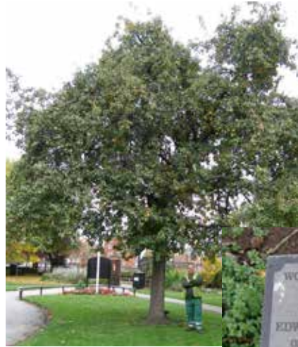
Perhaps the most famous Worcester Black in Cripplegate Park planted in 1932

All the young trees I know of are the same and most likely the result of the aforementioned scheme when WCC and Pershore College were selling young trees. However, perhaps the best known supposed Black Worcester is the one in Cripplegate park in Worcester City Centre which has a plaque commemorating its planting in 1932 by then Prince of Wales (future King Edward). However on closer inspection this appears to be distinctly different from what one now buys as a Worcester Black Pear tree from contemporary nurseries. So the historic Cripplegate Worcester Black Pear appears to be one version of the Black Pear whilst what all the young trees produce is seemingly another version (see photos). I have found the Cripplegate type on three other trees in the Martley area, all older trees, whilst I have found only one old tree of the more common