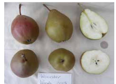
Anatomical details of the Martley [TOP] and the Worcester woods types [BELOW]