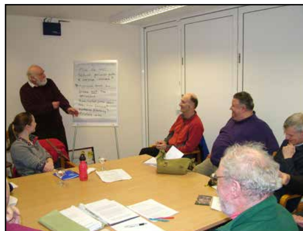
Here's a group of members working up ideas