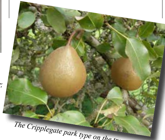
The Cripplegate park type on the tree

whilst at the same period, 1667, London nurseryman George Ricketts offered a Red and a White Worcester as well as three types of Warden pear although Forsyth (1810) and Hogg (1884) suggest that the Black Worcester was the original Warden Pear. So for now, the Worcester Black appears to have at least two pretenders to the crown. Which is the real one? Or are they similar — could one be a sport of the other ??? There is of course the possibility of seedling pears being that bit different and so leading to several different types. Pears is a much under-studied subject and I am not aware any work has been done on how true or diverse seedling pears can be. In the case of apples, seedling trees can produce vastly different fruit to their parents, due to the genetic diversity and random nature of cross pollination in the genus Malus .