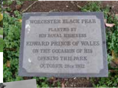
The plaque is evidence that someone clearly believed that in 1932 this was what constituted Worcester Black