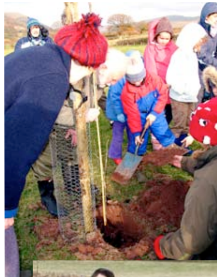
Young and old got stuck in to tree-planting, firstly at the opening (left) and again in the early spring.