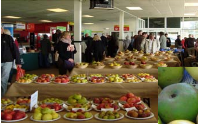
Hereford Food Festival