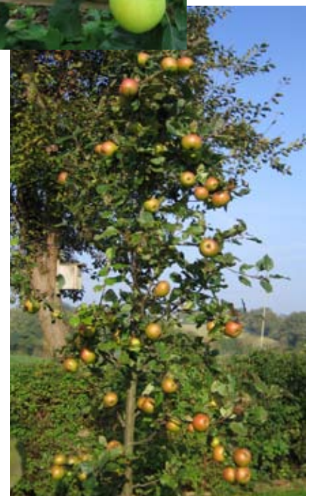
A handsome specimen of Chateley's