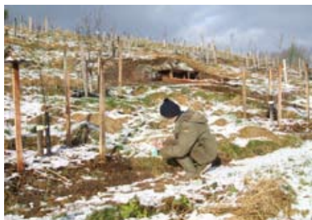
Testing soil pH: also showing site slope, tree guards and spacing

Trees were sourced from nurseries in England, Wales and Scotland. Planting included a few 3-year old trees from the original garden, several Graft 'n' Go specimens, many 1-year old and some 2-year old trees and lately some of my own whip and tongue grafts, including a Bulmer's Norman cider apple from our former orchard in Wigmore, Herefordshire. Most rootstocks are M26, with M25 in the more exposed area and a few varieties on MM106 and MM111. The apples can be classified into four groups: old English, e.g. Charles Ross, Golden Pippin, Ribston Pippin; Scottish,