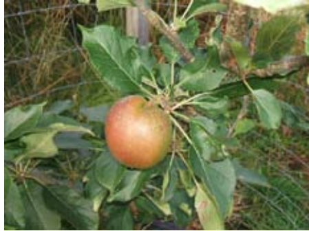
King's Acre Pippin first fruit on this Marcher variety

Initial results have been encouraging in that we are able to eat and enjoy our own