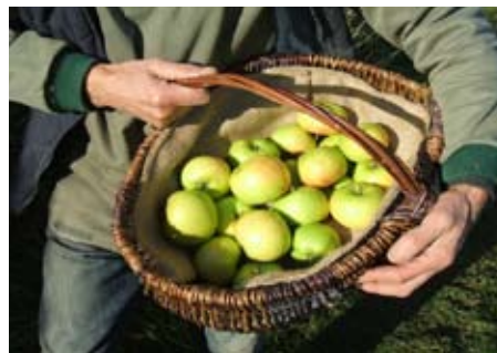
Stirling Castle Harvest crop of 20 apples from one tree in 2008

There are several hazards to establishing an orchard, some common to wherever you are but some peculiar to this location. Of immediate concern here is the risk of late spring frosts, the worst recently being -5°C on 17th May 2005. By having over 50 apple varieties, I am hoping the different flowering times will help some of them avoid these isolated but damaging frosts. Notwithstanding our longer summer daylight hours, the maximum temperatures reached are lower than apple trees will experience elsewhere in Britain. From my own daily temperature records there have been only three years in the last ten when the monthly average maximum has been 20°C or above (July in 1999, 2003 and 2006). I expect such low summertime maxima to adversely affect growth rate and productivity. Autumn is early and varieties are much later in reaching maturity than, say, in Kent. We find that Discovery is best eaten 4-6 weeks later, into October, although a friend with