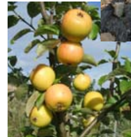
Yellow Ingestrie healthy crop of small but tasty fruit

is ever present, hares are in small number but have cut off young trees like hazel and pine, roe deer are fortunately smaller than the red deer but still capable of grazing at a reasonable height and the male has damaged other trees, especially aspen and pine, by rubbing off antler velvet. When the apple trees are first planted I stake and tie low down, add a plastic spiral guard and a smallish circle of chicken netting. In the second year that netting is removed and a one metre square area around the tree is staked out with 2" x 2" posts and stockproof netting fixed to a height of one metre. The gap at ground level facilitates the annual removal of weeds, mostly grass, buttercup and bracken. This weed control can be quite a chore so I have tried adding a bracken mulch, replaced every autumn, to suppress their growth but not with complete success. I have now tried adding a layer of recycled silage wrap over the mulch; I found this material worked well elsewhere in the plot to clear weeds, including dock and nettles, from neglected areas to be brought under cultivation. This weed control remedy seems to be successful.