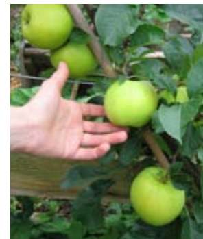
Fine examples of Greensleeves